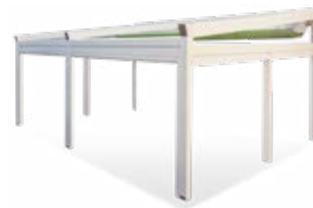
Retractable pergola for large spaces