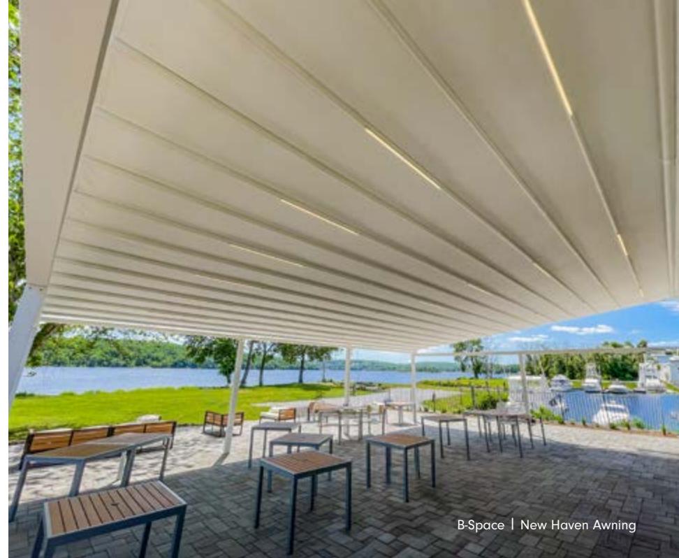
B-Space | New Haven Awning