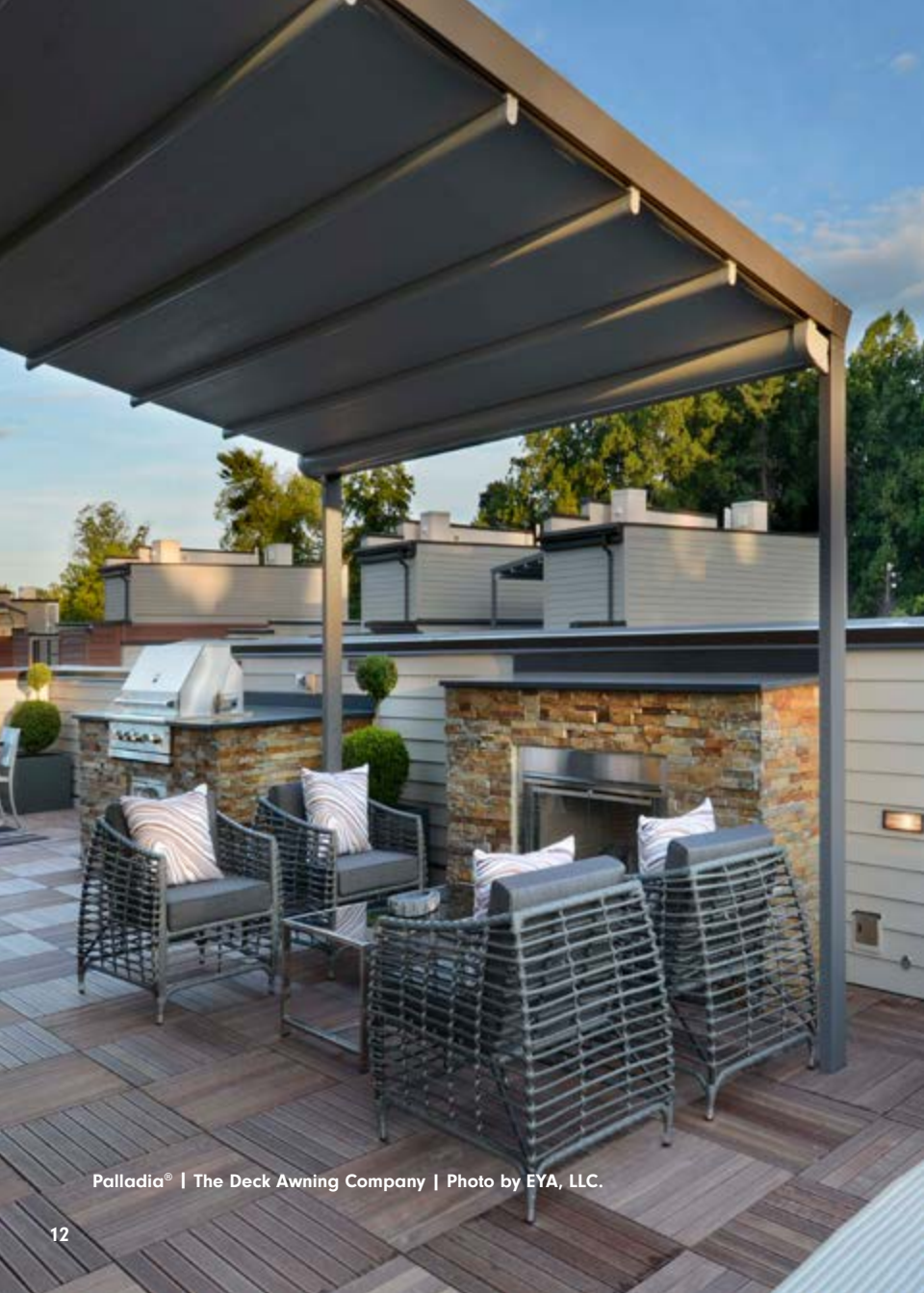
Palladia® | The Deck Awning Company | Photo by EYA, LLC.