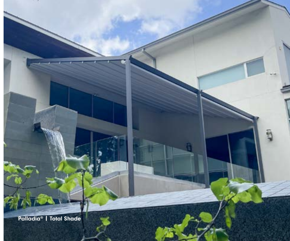
Palladia® | Total Shade