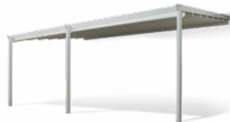
Classic, aluminum retractable pergola